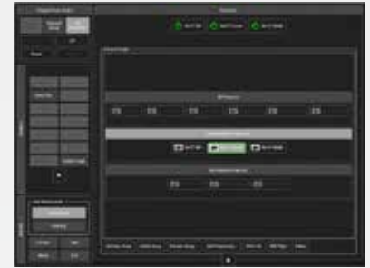
Manage groups and subgroups of projectors