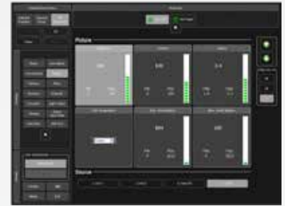
Control all relevant image settings with one touch

APPROVED FOR PUBLIC RELEASE; DISTRIBUTION IS UNLIMITED