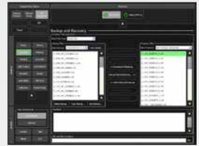
Quickly download or upload all relevant settings