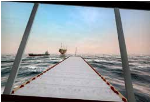
Maritime - Instructor Workstations & Naval Training