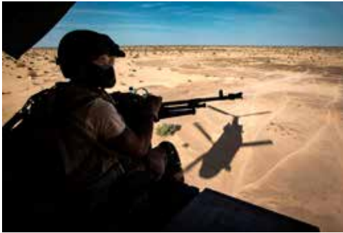
Ground - Advanced Weapons