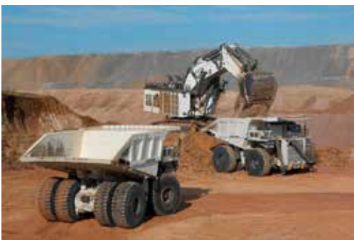
Mining - Heavy Equipment & Cranes