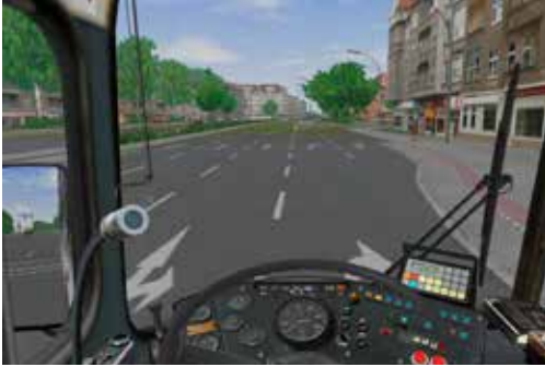
Driving - Car, Trucks and Public Transportation Vehicles

TREALITY® simulators are deployable in many markets, ranging from flight, vehicle and ground simulation, to mining. Any application that needs compact and high-quality dome simulation, close to the site of the operation, will benefit from the new TREALITY® TD-series.